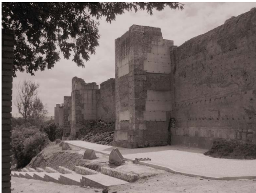
Figure 2. East sector view of City Walls of Niebla, Huelva. (González Serrano, 2009).

These features can be defined as constructions invariants, meaning that they remain despite time as a hallmark of the region.