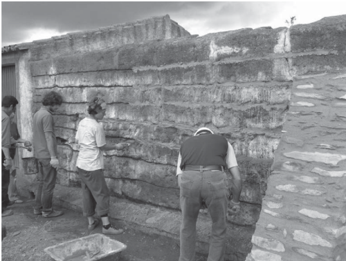
Figure 5. Course of bio-construction: earth plaster workshop (Canivell, 2006).