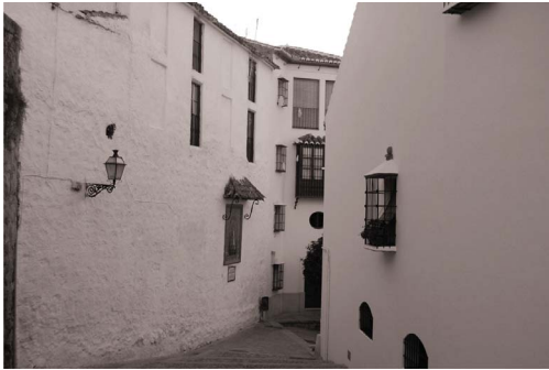
Figure 1. View of a street in Antequera, Málaga (Rodríguez García, 2010).

Distinctions are embodied as iconographic traces according to the technique employed in a particular historical period. Combinations with basements, chained stone or ceramic brick underline the Roman and Arabic heritage (Fig. 2).