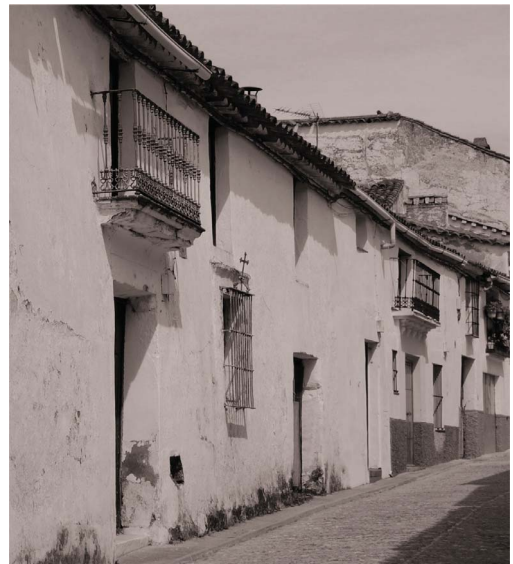
Figure 3. Limed wash façade on andalusian popular architecture. Aracena, Huelva (Rodríguez García, 2011).

Technical training in the construction sector has been organized and channeled to follow trends